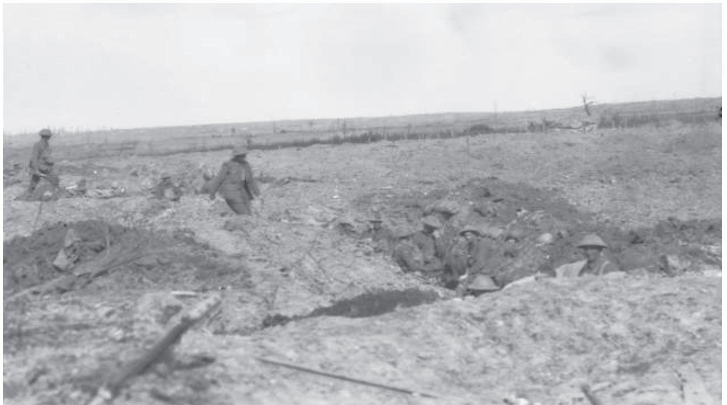
AUSTRALIAN WAR MEMORIAL

With the collapse of Russia in October 1917, a major German offensive on the Western Front was expected in early 1918. This came in late March and the 5th Division moved to defend the sector around Corbie. During this defence, the 57th Battalion participated in the now legendary counter-attack at Villers-Bretonneux on 25 April. When the Allies launched their own offensive around Amiens on 8 August, the 57th Battalion was amongst the units in action, although its role in the subsequent advance was limited. The battalion entered its last major battle of the war on 29 September 1918. This operation was mounted by the 5th and 3rd Australian Divisions, in co-operation with American forces, to break through the formidable German defences along the St Quentin Canal. The battalion withdrew to rest on 2 October and was still doing so when the war ended. The battalion disbanded in March 1919.