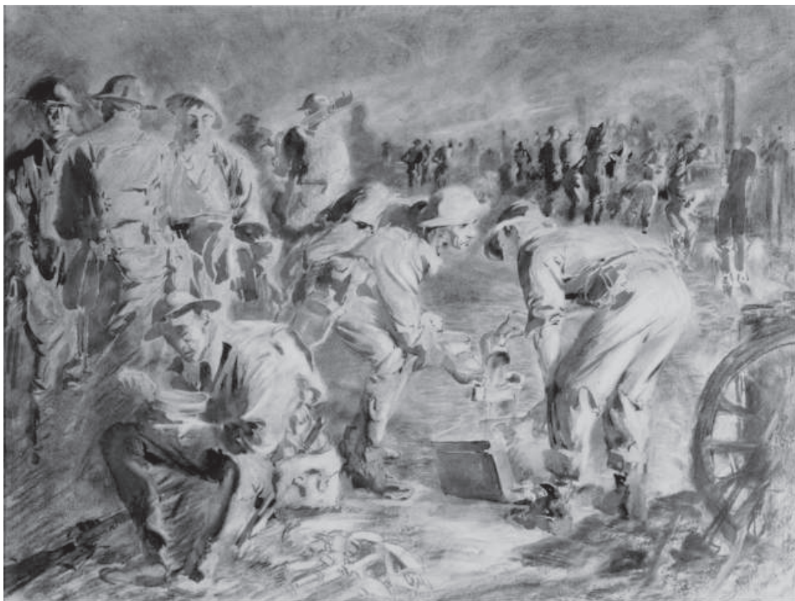
AUSTRALIAN WAR MEMORIAL