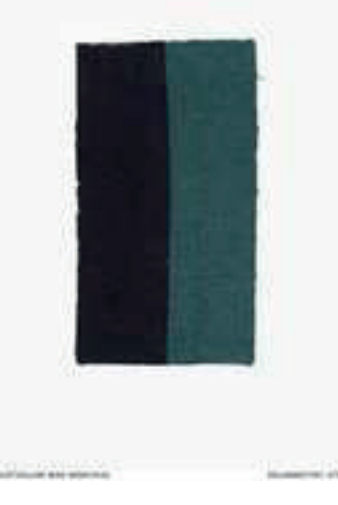
Colour Patch 53rd Battalion

The 53rd Battalion was raised in Egypt on 14 February 1916 as part of the "doubling" of the AIF. Half of its recruits were Gallipoli veterans from the 1st Battalion, and the other half, fresh reinforcements from Australia. Reflecting the composition of the 1st, the 53rd was predominantly composed of men from the suburbs of Sydney. The battalion became part of the 14th Brigade of the 5th Australian Division.