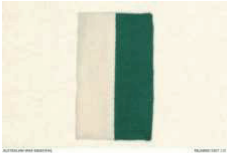
56 th Colour Patch

The 56th Battalion was raised in Egypt on 14 February 1916 as part of the "doubling" of the AIF. Half of its recruits were Gallipoli veterans from the 4th Battalion, and the other half, fresh reinforcements from Australia. Reflecting the composition of the 4th, the 56th was predominantly composed of men from New South Wales. The battalion became part of the 14th Brigade of the 5th Australian Division.