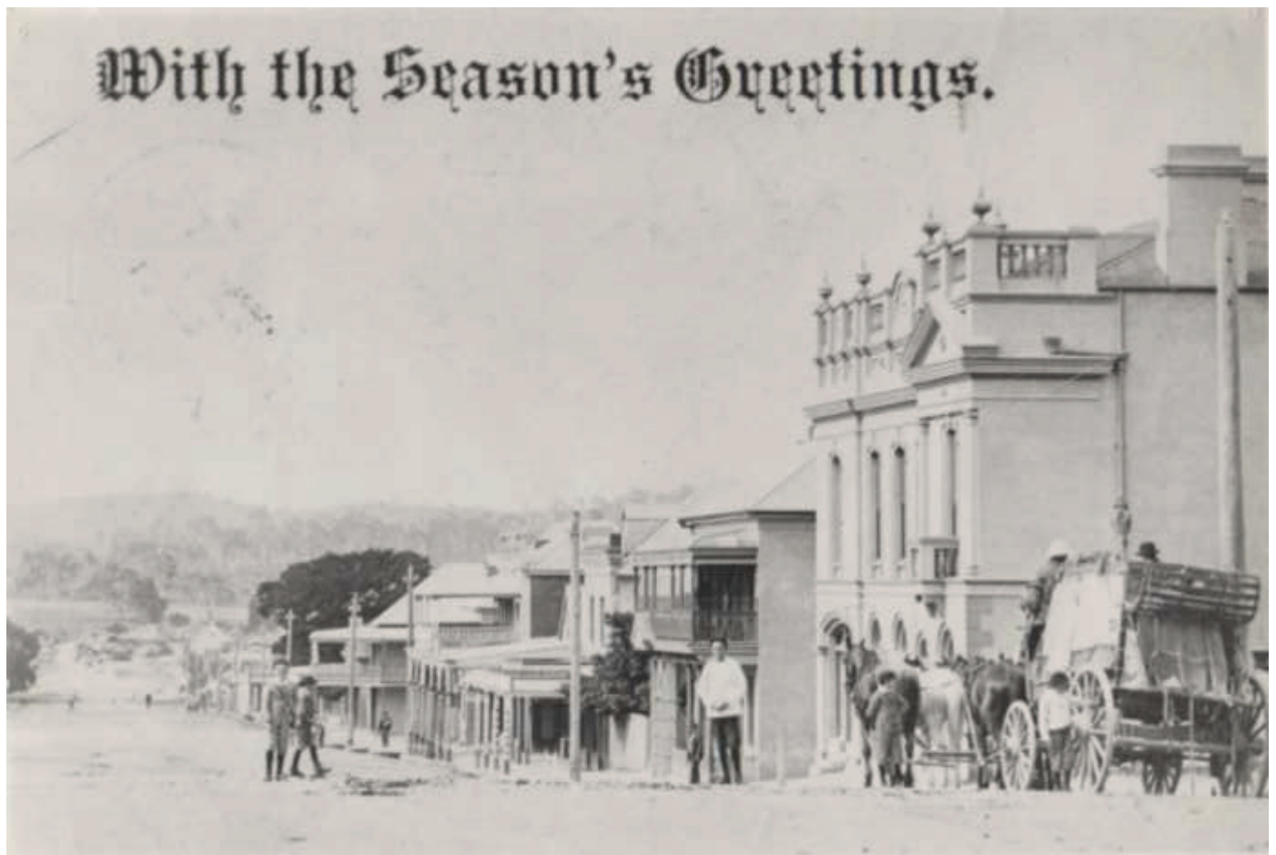
Wallace Street, Braidwood, early 1900s.