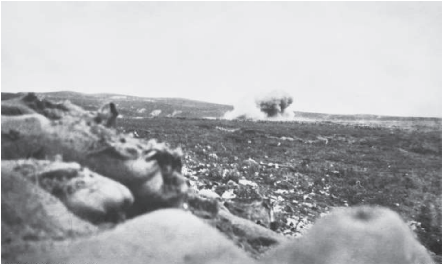
1915, Ottoman Empire: Turkey, Dardanelles, Gallipoli, Sari Bair Area, View of Hill 971, from Durrant's Post.