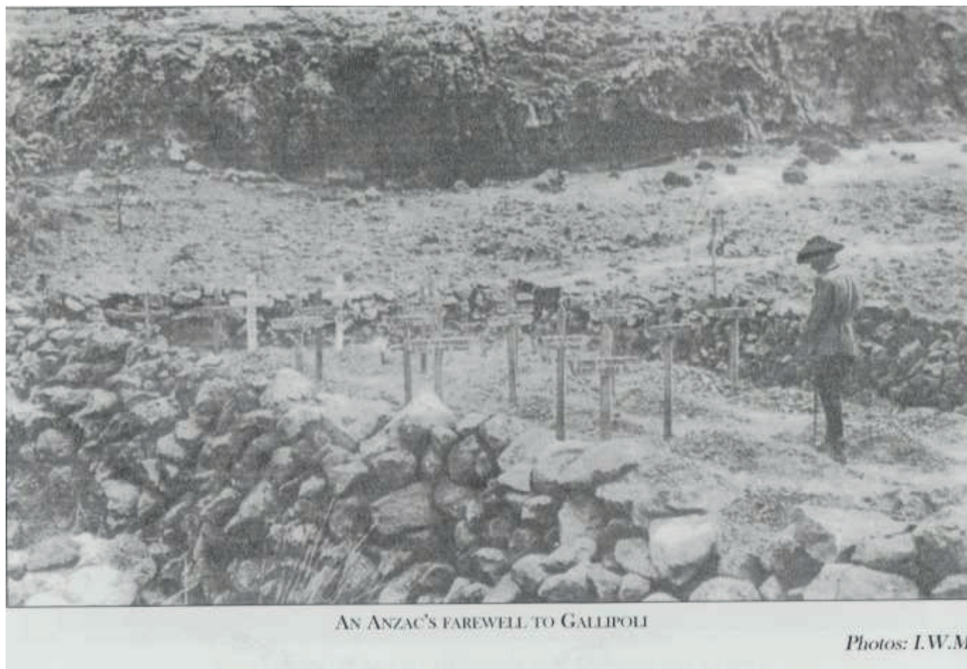
Photo published in "Braidwood Letters from the Front" by Roslyn Maddrell.