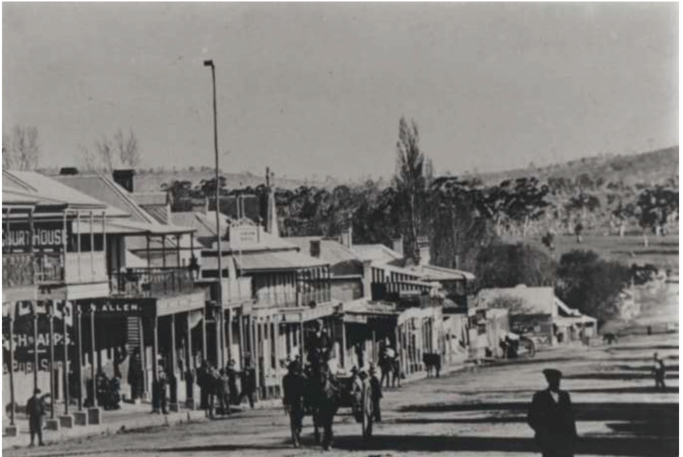
Wallace Street, Braidwood, early 1900s.